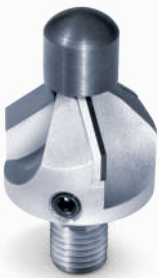
PCD Countersink Cutter z = 2 z = 3